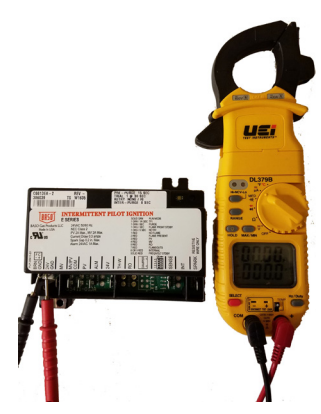
Fig. 3 BASO Ignition Control